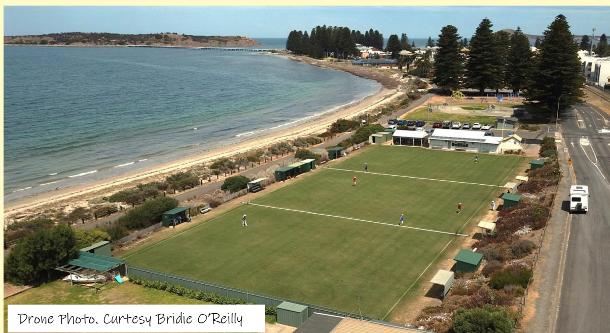
Drone Photo.