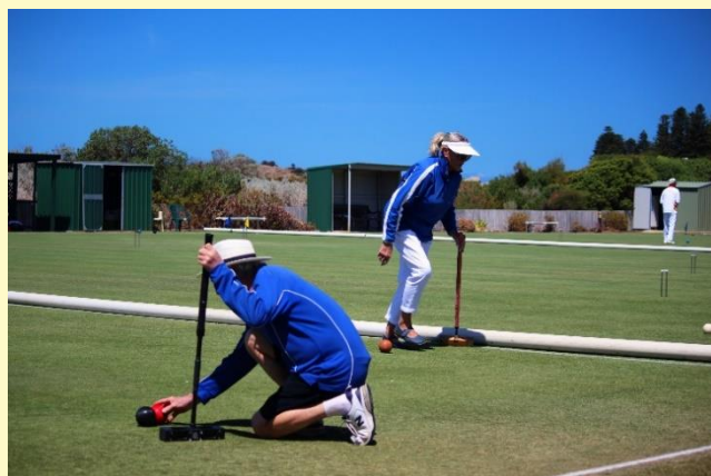
Perfect for the famous Victor Harbor Roll.